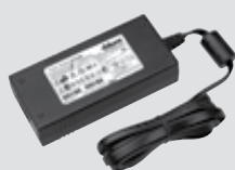
Blum plug-in transformer