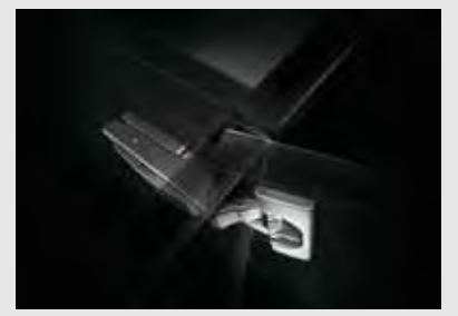
New pivot points ensure a smaller side gap even for thicker doors.