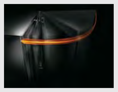
Silent and effortless closing – regardless of the closing speed or door size.