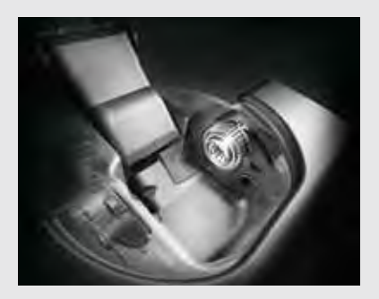
The lift mechanisms can be adjusted to the respective door weight using a cordless screwdriver.