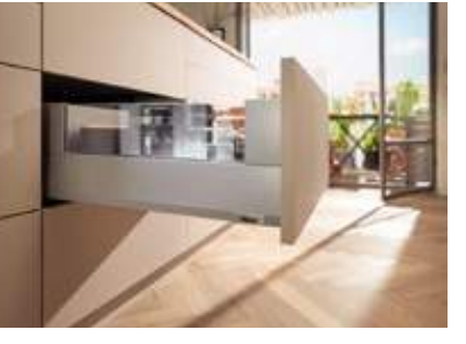
MERIVOBOX modular with BOXCOVER MERIVOBOX modular with BOXCAP Glass design elements capture the light