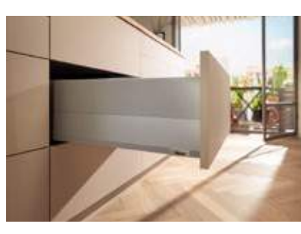
Experts consistently opt for metal: it accentuates the clear cut design.