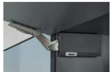
AVENTOS HK top with dark grey cover cap

The AVENTOS HK-S stay lift for small fronts has a new look. Its cover caps have been refashioned, creating a minimalist and sleek design to match AVENTOS HK top. The new cover caps come in three colours: light grey, silk white and dark grey. The small stay lift fits stylishly into cabinets of different designs and delivers top quality motion.