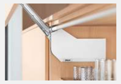
AVENTOS HL in silk white