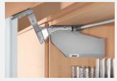
AVENTOS HS in light grey