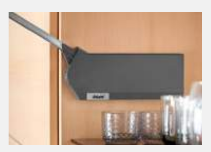
AVENTOS HF in dark grey