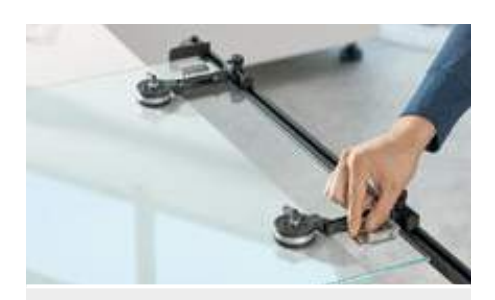
Easier positioning with new adhesion template