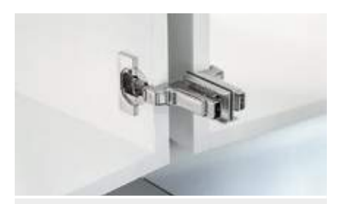
The new adhesive mounting plate also enables fronts that protrude at the sides to be implemented