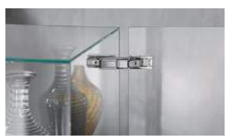
CLIP top BLUMOTION CRISTALLO with adhesive mounting plate for glass display cabinets