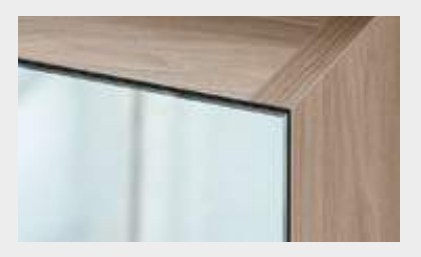
Front overlay of up to 19 mm