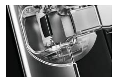
Soft-close mechanism seamlessly integrated into the hinge boss