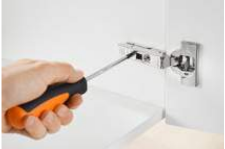
Convenient 3-dimensional adjustment for a harmonious gap layout.