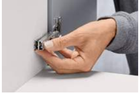
The CLIP assembly method is tool-free, quick and easy.