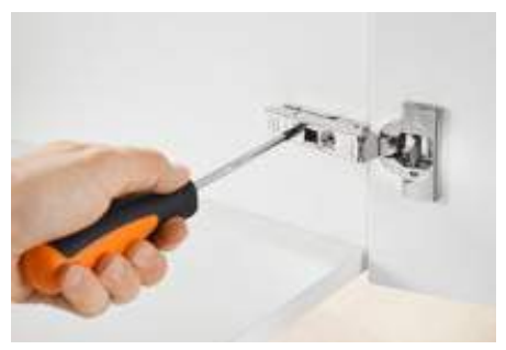
Convenient 3-dimensional adjustment for a harmonious gap layout.