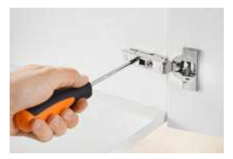
Convenient 3-dimensional adjustment for a harmonious gap layout.