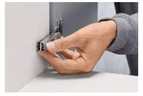
The CLIP assembly method is tool-free, quick and easy.