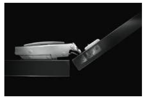
Small drilling depth of 11.5 mm for door thicknesses from 15 mm