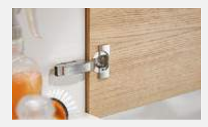
Continuous development of high quality hinges – for more reliable functionality every day