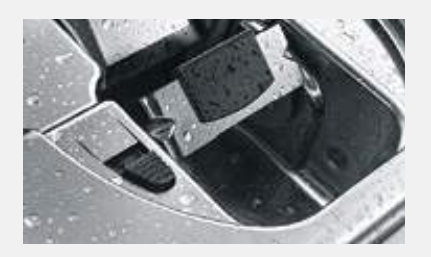
The galvanically refined coat covers the hinge like a protective seal