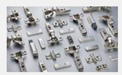
This programme comprises several main hinge types and relevant accessories