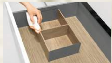
AMBIA-LINE for high fronted pull-outs in wood design