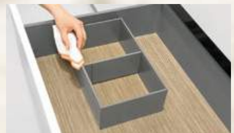
AMBIA-LINE for high fronted pull-outs in steel design