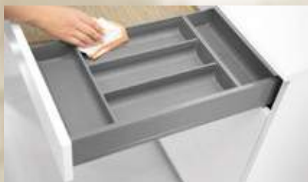
AMBIA-LINE cutlery insert in steel design