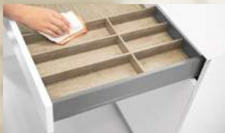
AMBIA-LINE cutlery insert in wood design