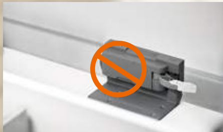
SERVO-DRIVE, the electric motion support system