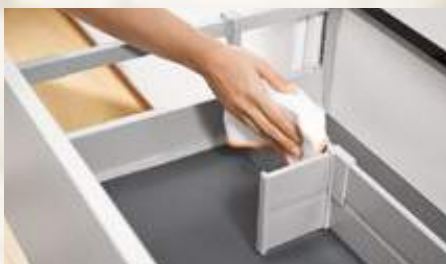
ORGA-LINE cross divider