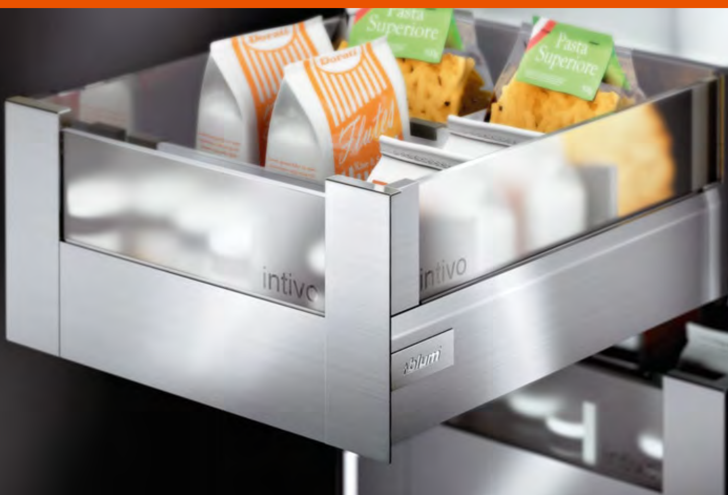
Inner pull-out with glass design elements by Blum.