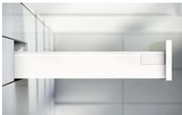
There is a matching drawer to go with TANDEMBOX antaro.