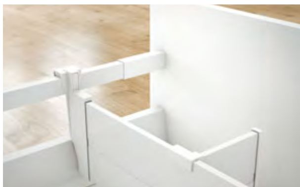
All components are colour coordinated: ORGA-LINE for TANDEMBOX antaro. The colour of the nylon parts matches that of the drawer side.