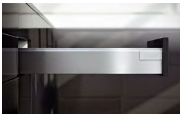
A matching drawer is available with TANDEMBOX intivo.