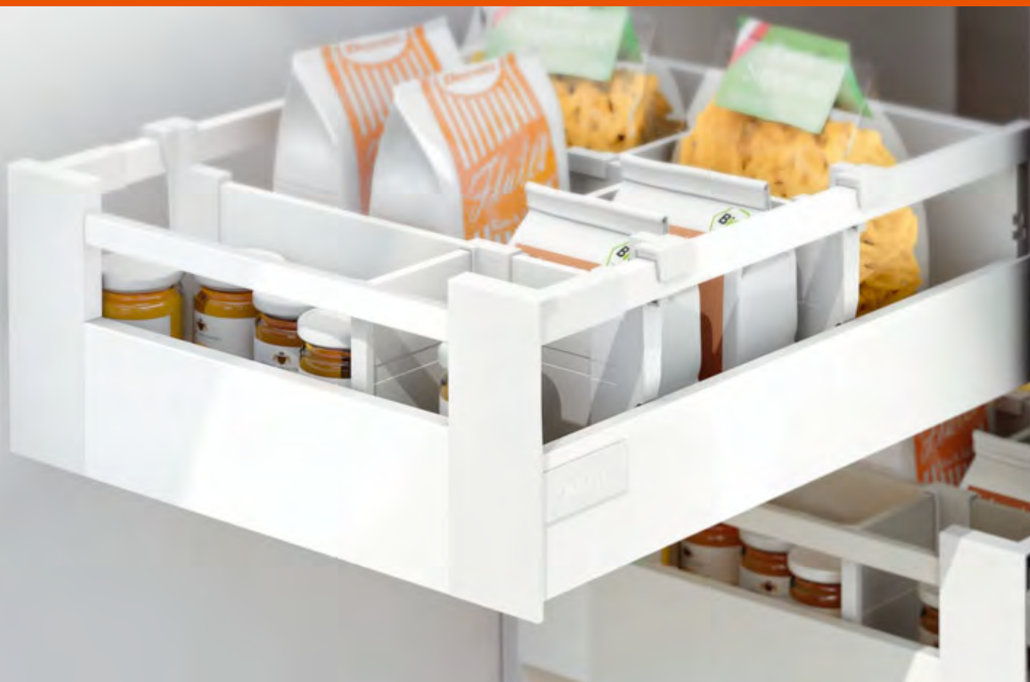
Inner pull-out with simple rectangular gallery.