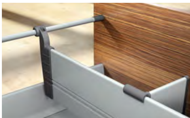
ORGA-LINE longside and cross dividers organise interiors. The ORGA-LINE components for TANDEMBOX plus are dust grey.