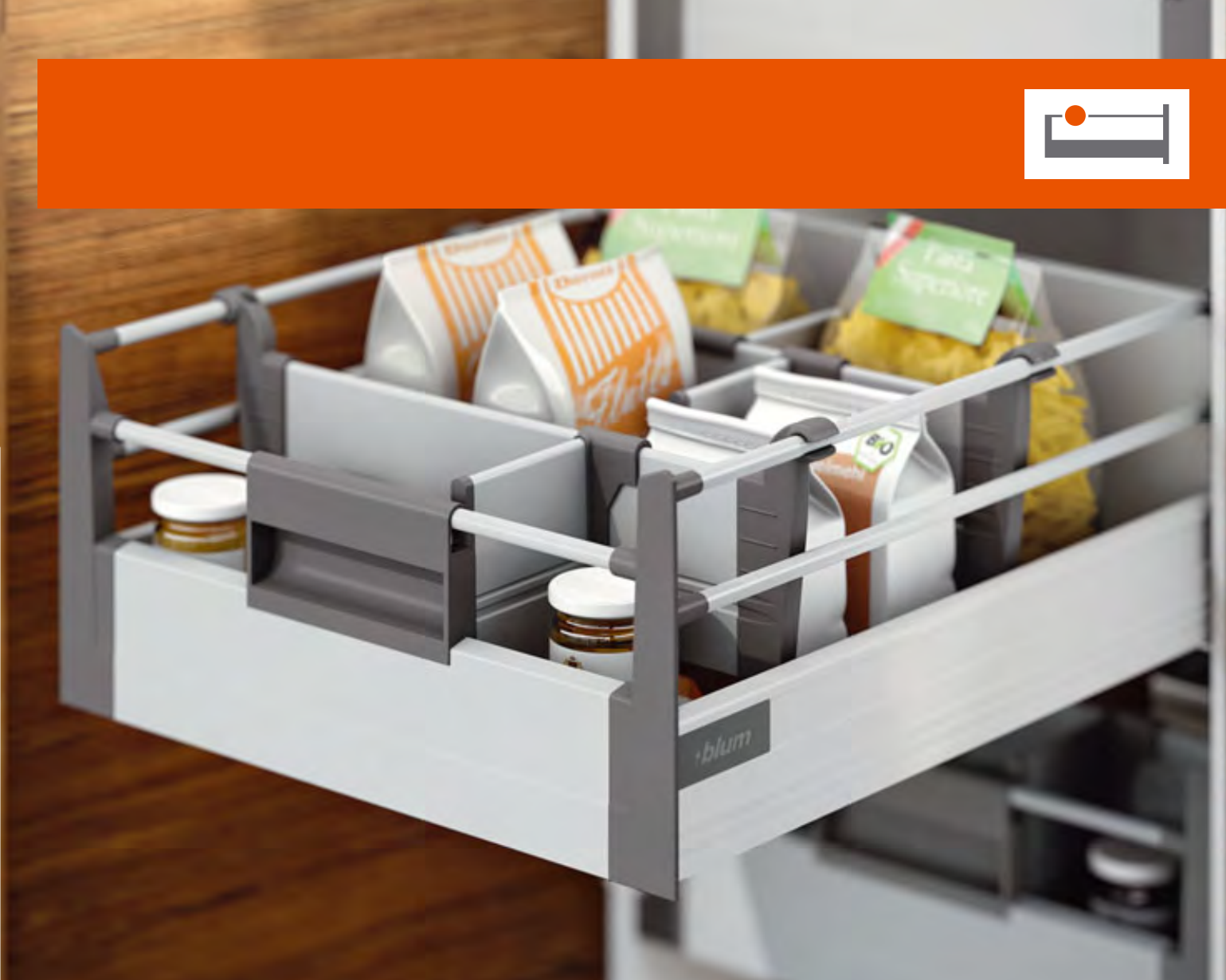
Inner pull-out with double gallery.