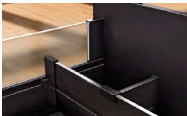
The design and colour of ORGA-LINE have been adapted to TANDEMBOX intivo. The colour of nylon parts matches that of drawer sides.