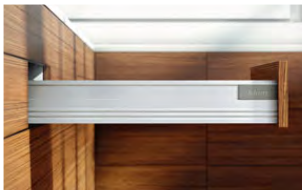
Matching drawers complete the TANDEMBOX plus line.