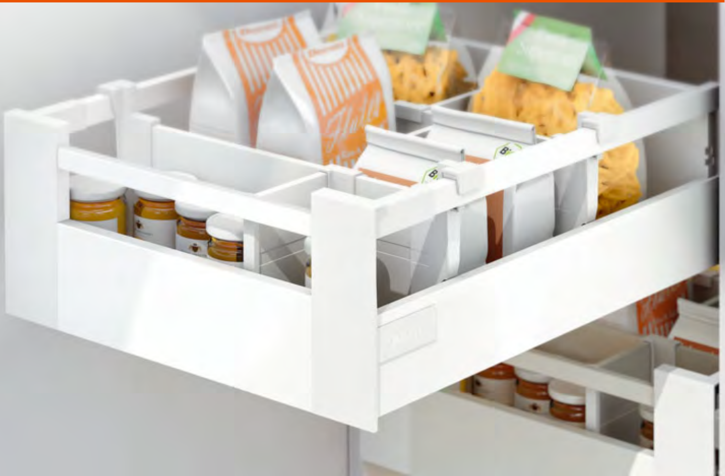
Inner pull-out with simple rectangular gallery.