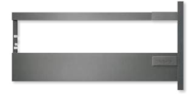
TANDEMBOX antaro with gallery

TANDEMBOX offers a wide programme range for a host of different applications: from an open drawer box with a gallery and closed sides with glass design elements through to a fully closed metal drawer box.