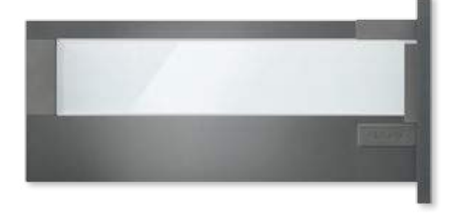
TANDEMBOX antaro with design element