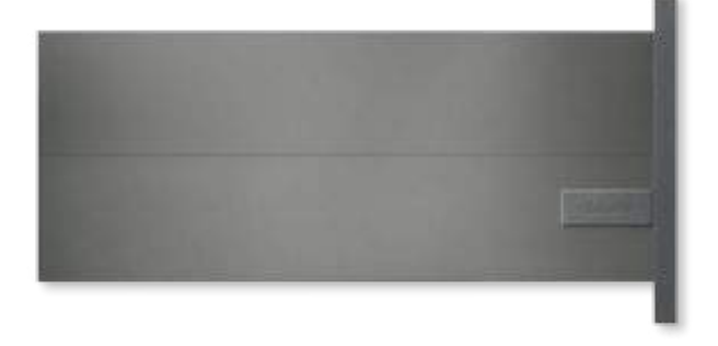
TANDEMBOX intivo with BOXCAP