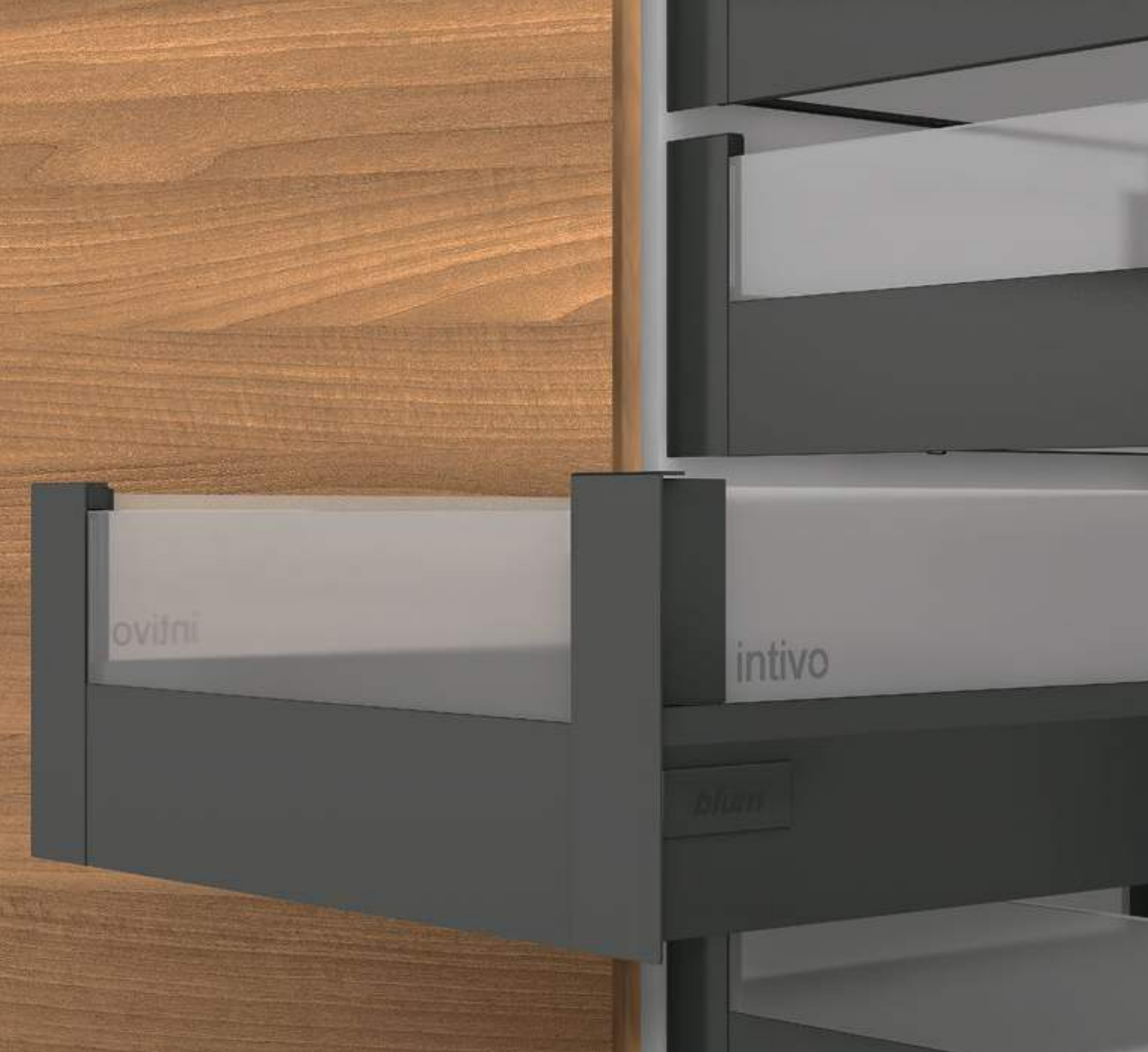
Inner pull-out with glass design elements by Blum.