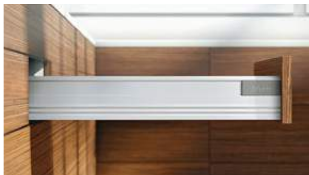
Matching drawers complete the TANDEMBOX plus line.