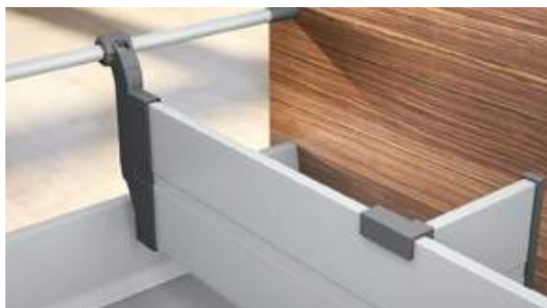
ORGA-LINE longside and cross dividers organise interiors. The ORGA-LINE connecting components for TANDEMBOX plus are dust grey.