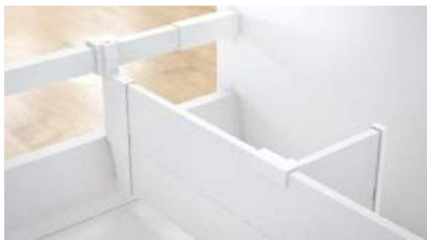
All components are colour coordinated: ORGA-LINE for TANDEMBOX antaro. The colour of the nylon parts matches that of the drawer side.