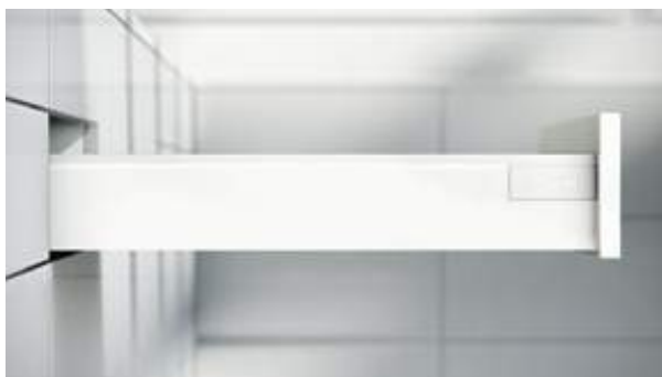
There is a matching drawer to go with TANDEMBOX antaro.