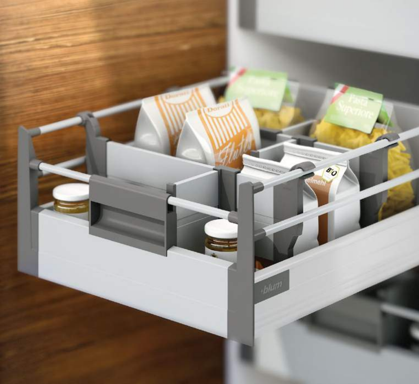
Inner pull-out with double gallery.