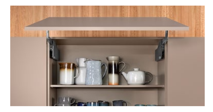
Elegant motion and clear visibility of contents: Even with large wall cabinets, no stabiliser rods are needed.