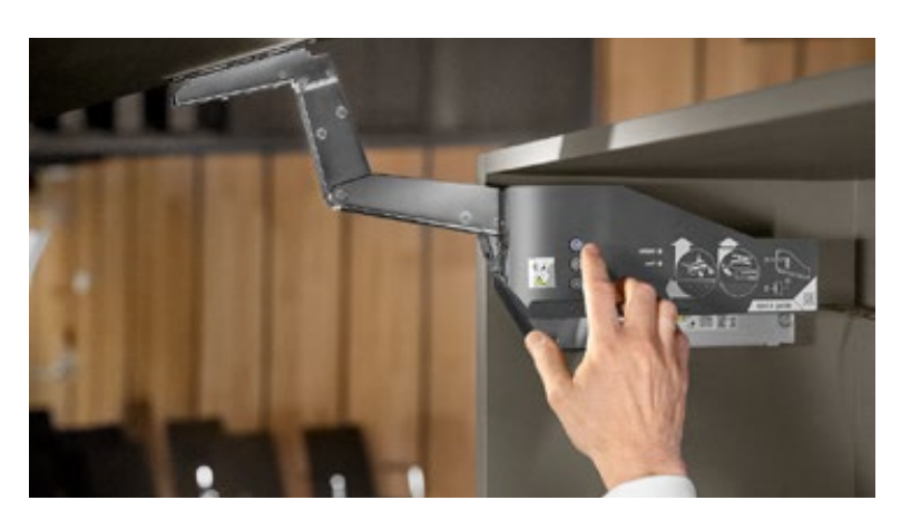
Colour signals with integrated error recognition support the start-up process.