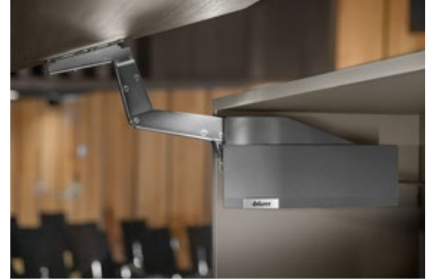
Even with SERVO-DRIVE, AVENTOS top features a slim design.