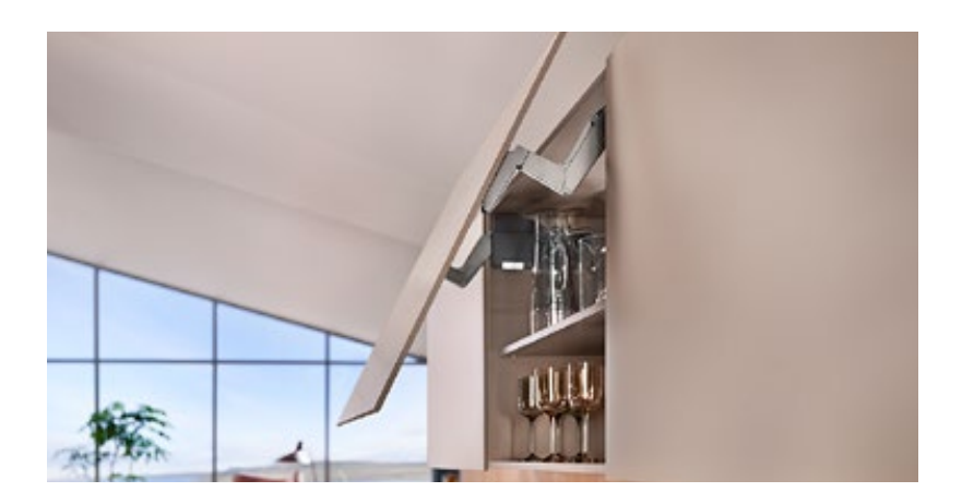
Slim and elegant: Fronts from 8 mm are possible with the EXPANDO T fixing system.

Putting the crowning touch on fine furniture: For example by incorporating design details.