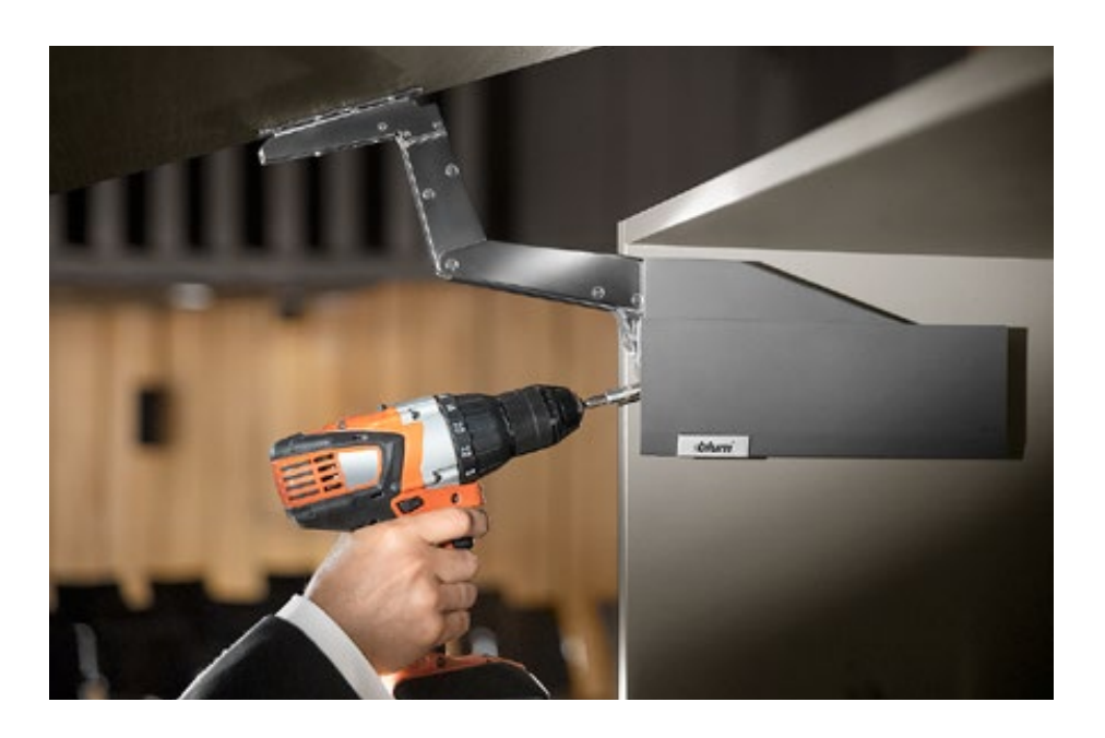
The lift mechanism can be conveniently adjusted from the front even with the cover cap already in place.

With the fittings of the AVENTOS top family, you have two options for installing the lift mechanism: either with the system screws or using the integrated positioning system. You can assemble the lift mechanism quickly, easily and correctly – and without the need for calculation thanks to predefined fixing positions. The integrated BLUMOTION soft-close system and opening angle stops are also simple to adjust.